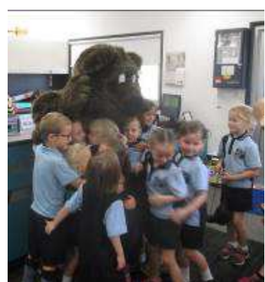
The Angry Bear with the Prep/Yr1 students.

It was great to see the support we received for Book Fair this year. There was a great range of books on offer! Reading is a joy for all ages! The Angry Bear even made an appearance!